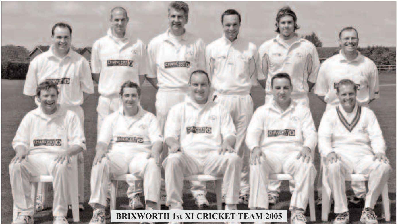
BRIXWORTH 1st XI CRICKET TEAM 2005