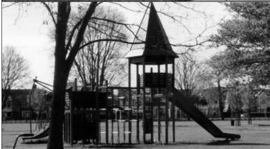
Play equipment at Market Harborough (Example suggested by PC)

At a recent parish council meeting and from a blank page perspective, councillors debated the future of recreational facilities in the village, bearing in mind that nowadays residents are fortunate enough to be able to access the splendid new adventure playground at Brixworth Country Park.