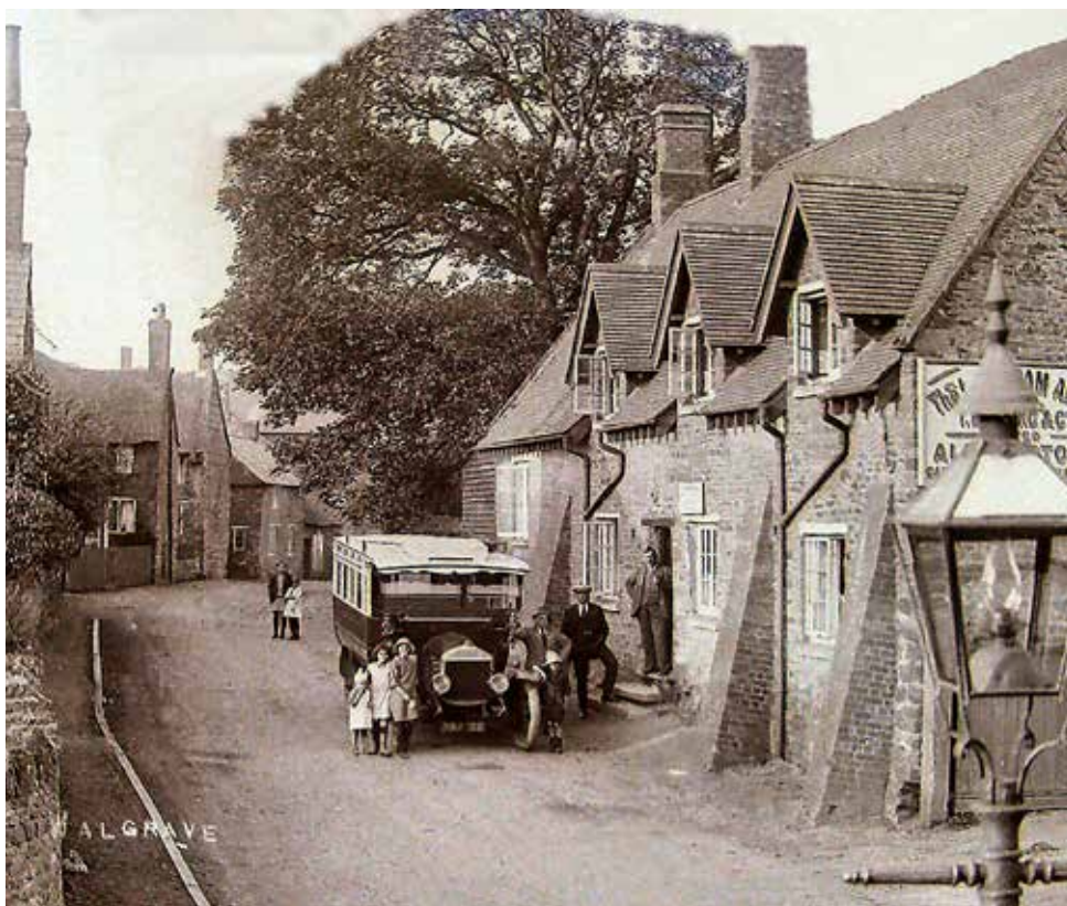
An early service bus parked outside the former Langham Arms pub in Walgrave

Of course Brixworth had its thriving railway station at that time; although quite a walk to get to it, it was possible to board a train to either Northampton or Market Harborough, and from there to anywhere in the land. One of my uncles was a porter on the old Spratton station, which was a mile to the south. Not that many ordinary folk did travel very far; they were far too poor and too busy earning a crust to go any distance. If you needed to go anywhere it was 'on yer bike' or shank's pony, or into town on the carrier's wagon, a bumpy ride sitting on plank seats put in the back of the cart. At this time there were a good number of motor lorries and buses beginning to appear, but hardly