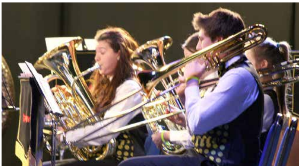
The prize-winning Youth Brass 2000 are looking forward to performing at All Saint's Church

Vocal music will be an important aspect of the festival, with the Northampton Musical Theatre Company's "Concert Group" and the village's own U3A Brixworth Songsters. The latter will be performing during the morning service on the 21st September, followed by an opportunity to hear young and gifted musicians from Brixworth. The Brixworth Music Festival will then be brought to a close with a concert of sacred choral